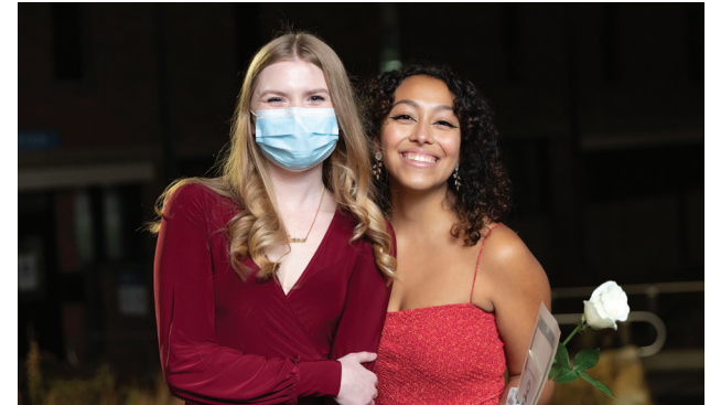
Joyful CCCC students