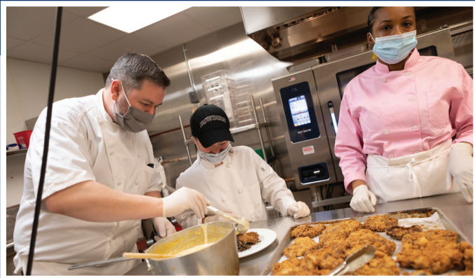
Faculty and students cooking in the kitchen of the Zammer Dining Room

All gifts to CCCC Educational Foundation are tax-deductible to the full extent of the law.